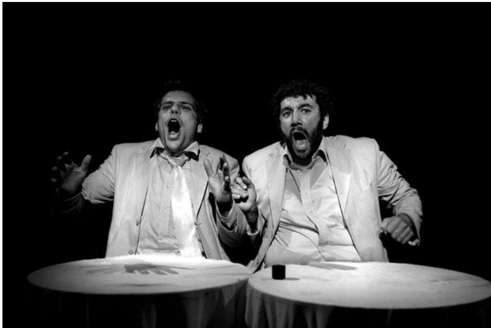
Photo of The Arab and The Jew

As with all Gecko shows, the first performance represents a new start and trajectory for the piece. I find it almost impossible to know a show until the audience interacts with it.