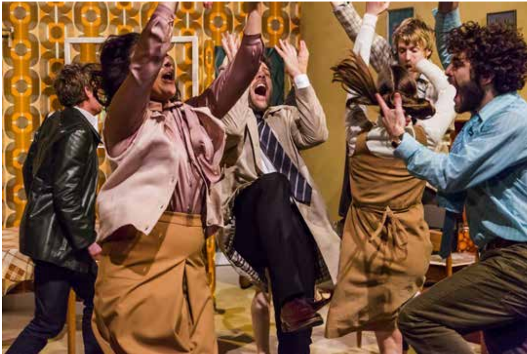
Photo of The Time of your Life