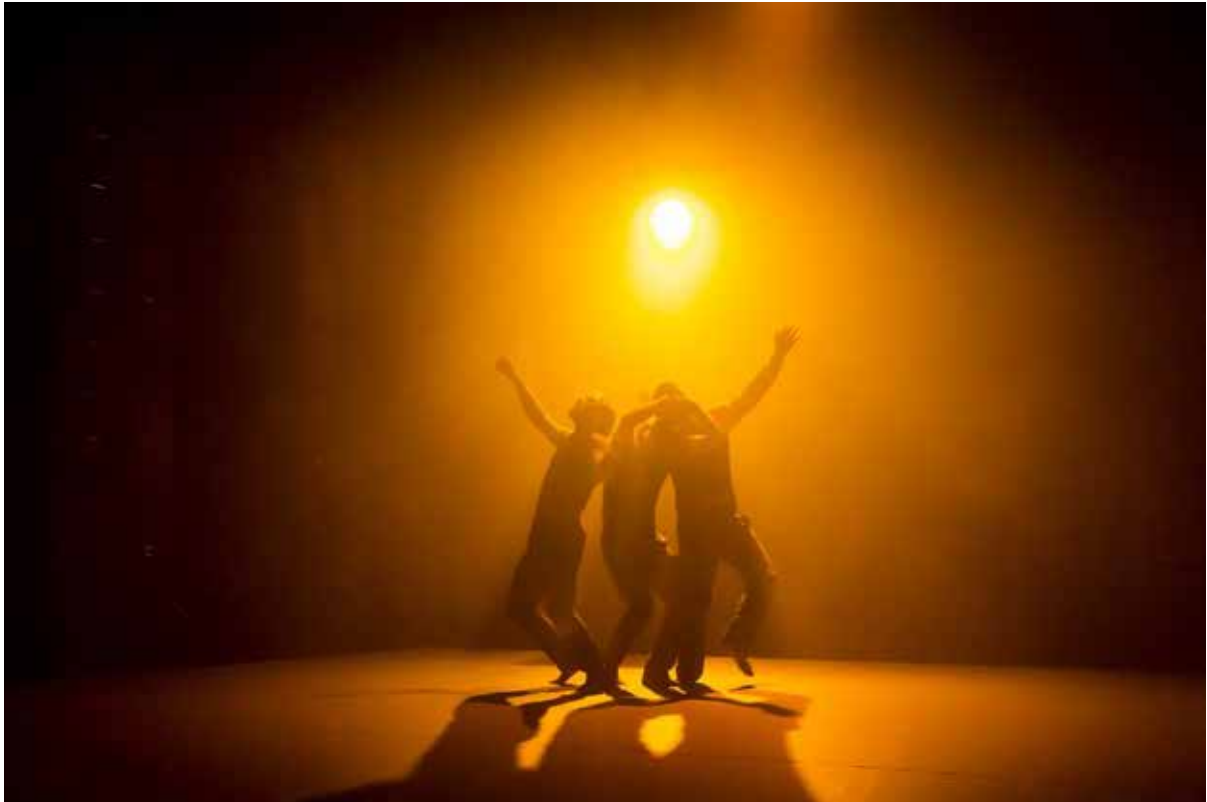
Photo of Institute